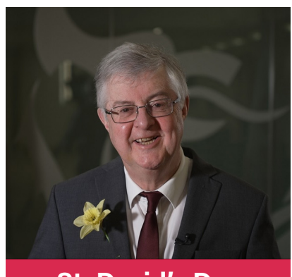
St. David's Day

The Curriculum is already being rolled out for younger learners in Wales. Once it reaches 14-16 year olds, it is vital that skills are being learnt which are helpful and transferable to the outside world. Give your views here.