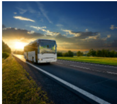
£39 Million for Buses

This new appointment was announced on International Women's Day. Clinical lead Dr Helen Munro will take charge of developing the Women's Health Plan for Wales. The plan will be informed by the health experiences of thousands of women and girls across the country. The Welsh Government also announced £750,000 of funding for research commencing from April 2025, focused on women's health. This follows findings that over half of women have reported long-standing illnesses and 40% of these women feel limited by them.