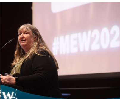
Tidal Lagoon Challenge

I am raising awareness about the Welsh Government offering help with school costs. Don't miss out on help with school essentials! 88% of those eligible have claimed their free School Essentials grant to help with costs like school uniforms, shoes, bags, sports kits and equipment. There's still time to check eligibility and apply for this year's funding now.