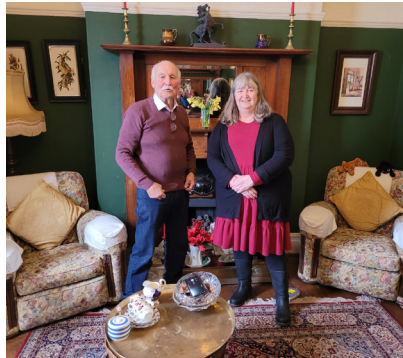
Dylan Thomas House

I met with the Swansea University Biotech Department who are putting in a bid for a grant of several million for a new Green Economy Centre. They are the only applicant from Wales and if awarded they will be one of only 5 successful applicants. Your local Labour MS have signed a letter to support the application which we hope will be ultimately be successful.