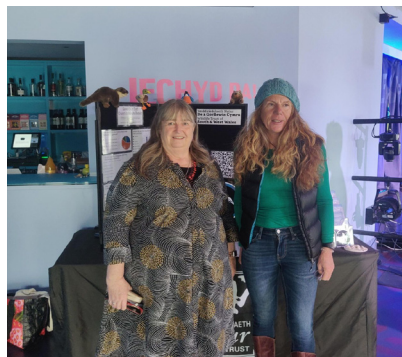
Voice for Our Rivers

'Creative for Climate Justice' was an exciting arts and social justice school project organised. The exhibition at the Pierhead showcased art pieces crafted by learners in Wales who used their creativity to shout a message about climate justice loud and clear!