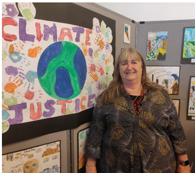
Climate Justice Event

I got to meet Pantosaurus, the mascot of the NSPCC campaign, "Talk PANTS". PANTS is an acronym, with each letter representing advice to give children regarding sexual abuse. The campaign has been running since 2013, and has helped over 6 million parents keep their children safe from sexual abuse. The NSPCC also provide schools with resources to help children keep safe, ensuring that they know the importance of personal safety, the difference between appropriate and inappropriate touching, and who they can speak to when they feel scared or unsafe.